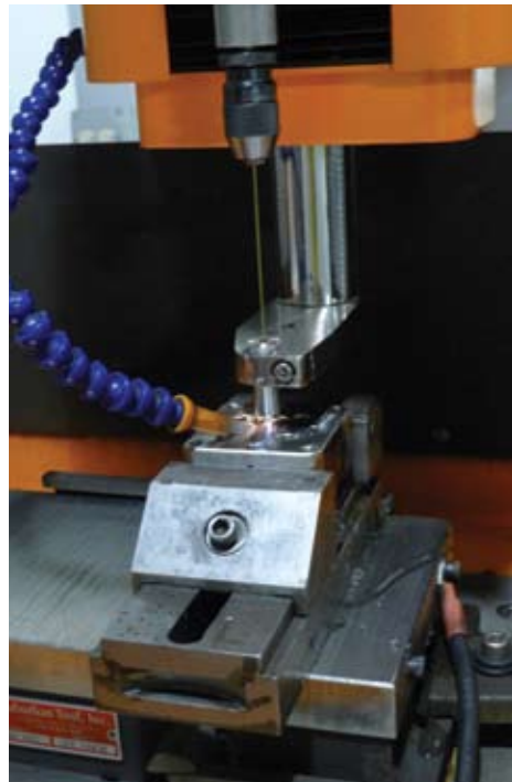
A holmaking EDM used for mold tooling production

The critical factor for engineering of nano tooling begins with a breakdown of tooling components and the materials required. Materials used range from S-7 for its overall good