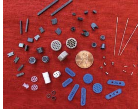
A selection of micro and nano parts produced by Dynamax Inc.

To overcome this, it is important to ensure that surface roughness is as smooth as possible.